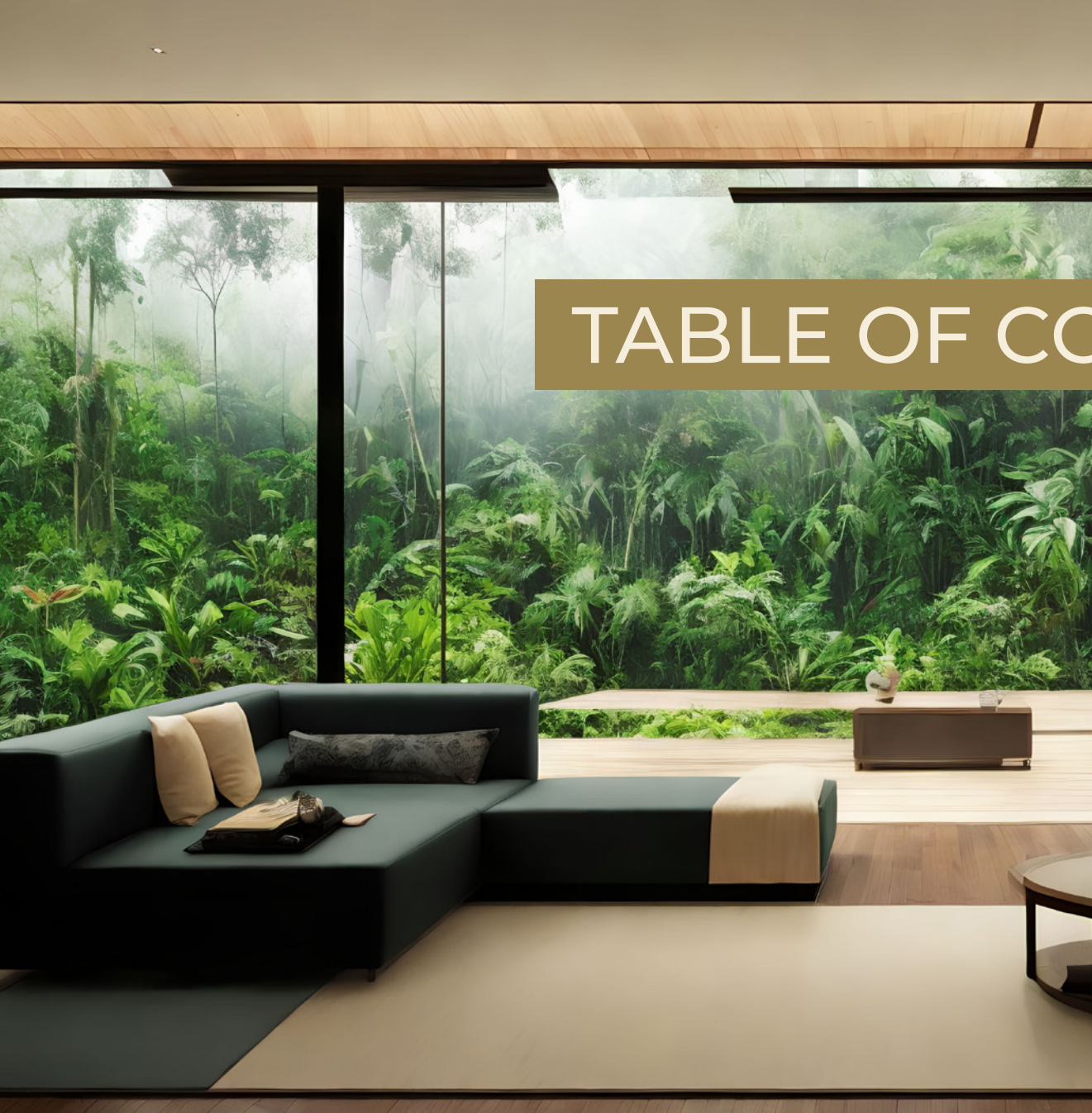
TABLE OF CONTENTS!